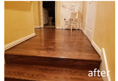
Floor and interior finishes remodeling